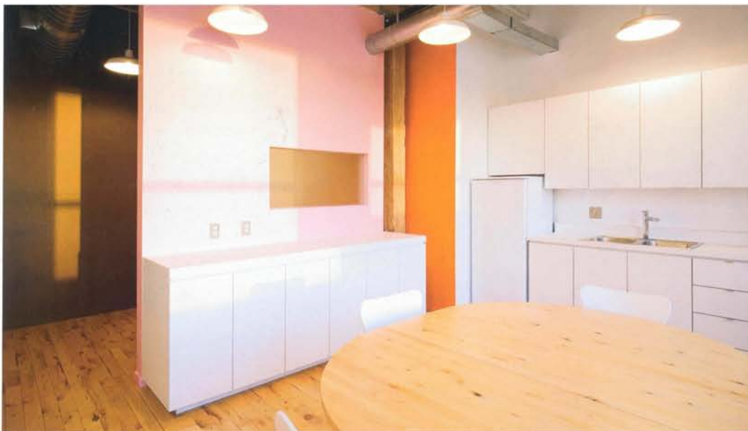
3 Meeting room